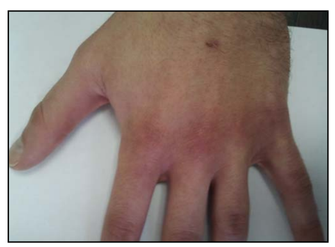
Fig. 5. Microbial eczema of the hands.

anxious depression, we transferred the patient to the Psychiatric Clinic. Follow-up examinations should take place after six months. However, the relatives refused the contact with the patient because of the harrowing experience, and confirmed that he had no serious persistent problems except alopecia.