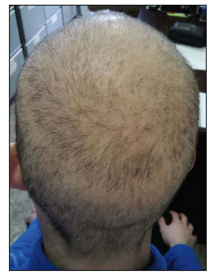
Fig. 4. Diffuse alopecia.

After 30 days of hospitalization and stabilization of the somatic status, the treatment with Prussian blue and penicillamine was terminated. Due to persisting mixed