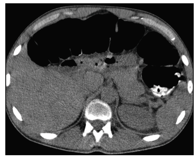
Fig. 3. Computer tomography. Marked meteorism of transverse colon.

After 30 days of hospitalization and stabilization of the somatic status, the treatment with Prussian blue and penicillamine was terminated. Due to persisting mixed