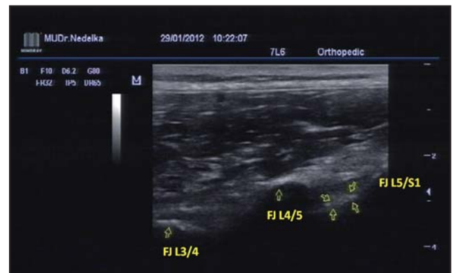
Fig. 1. Inplane ultrasound visualisation of lumbar facet joint. Linear probe, 5 MHz, focus depth set to 30 mm. FJ – corresponding facet joints. 4 arrows on the right side point at the nerve root, with typical „honeycomb” appearance.

FJ injection (Group B) contained 20 patients. In each patient, single injection of 6 ml 1% trimecaine and