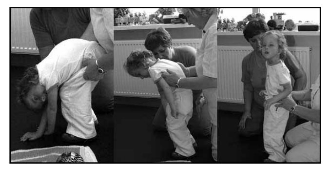
Fig. 4. Assuming erect position.

Rehabilitation is performed according to PNF method. Elements of educational kinesiology acc. to Dennison are also introduced. The aim of the carried out therapeutic rehabilitation is to prevent joint malformation and to maintain full range of their movement, improvement of muscle strength, formation of proper coordination of motor function as well as assuming erect position and learning locomotion (Figures 4 and 5).