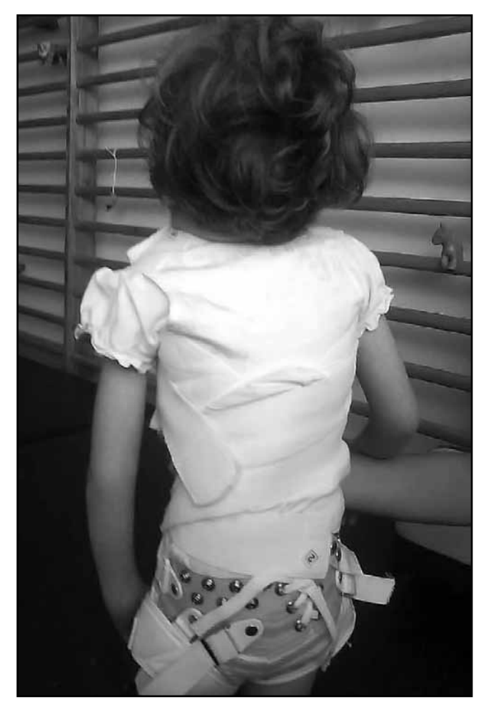
Fig. 6. SpineCore brace.

correction of life threatening malformations. Owing to greater and greater possibilities in these fields, the percentage of children who survived one month has clearly increased. However, only 5%–10% survive their first year of life (Brewer et al. 2002; Goc et al. 2006; Bos et al. 1992). Thus, some authors raise a question: whether undertaking the invasive methods of treatment is in