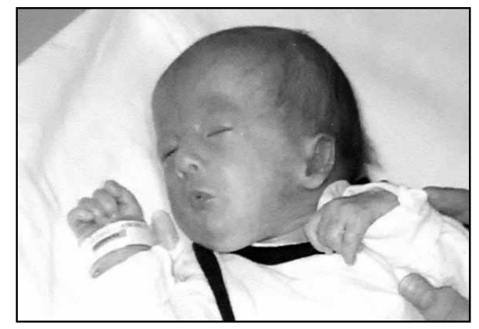
Fig. 2. A. P. in 8 week of life.